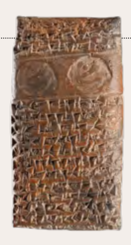
Clay cuneiform tablet Neo-Assyrian Period, 669 BC, Anatolia

The main floor of the museum greets visitors with works from different eras. It includes many items ranging from tablets from the archaeological site of Kültepe, to belts from Urartu, glass from the Roman Empire, to Byzantine ritual goods that all serve as an introduction to the rest of the collection.