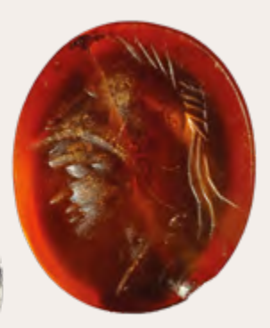
Seal rings and gem stones Late Hellenistic and Roman Periods, 2<sup>nd</sup> century BC – 4<sup>th</sup> century AD

Golden Solidus coin of Valentinianus II 375 – 392 BC