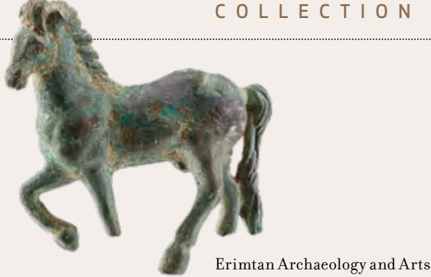
Bronze horse figurine Hellenistic Period, 3rd century BC

Museum presents the direct relationship between man and archaeology, and the stories of art, science, and social life that connect the past with the present.